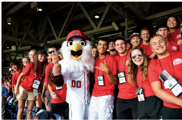
(Above) Youth Tour delegates from Kansas and Hawaii pose with "Screech," the bald eagle mascot for the Washington Nationals, during a baseball game against the San Francisco Giants.

Applications for the 2019 Youth Tour are due Feb. 1, 2019. Students may apply during their Junior year, using the application online at www.mwenergy.com > youth tour.