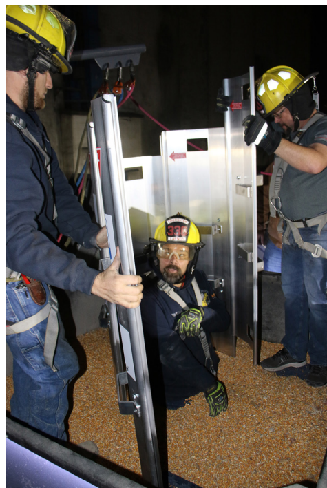
Learned firefighters assemble panels around a grain entrapment "victim" during rescue training.

Grain entrapment rescue tubes have multiple interlocking sections that can be slid around a person and pushed into the grain, shielding them from more grain pressing against the victim. The grain level inside the tube is then reduced in just a few minutes with a brushless battery-powered drill and auger, and the victim is removed. These devices make timely grain bin rescues a possibility. Continued on back