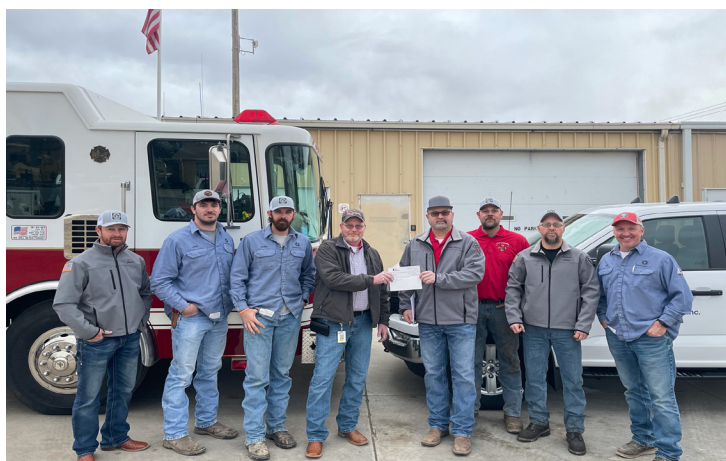
Midwest Energy employees present the Phillipsburg Fire Department with a check for $1,530 for grain entrapment rescue tubes and accessories. Twelve other rural fire and EMS departments received similar funding.