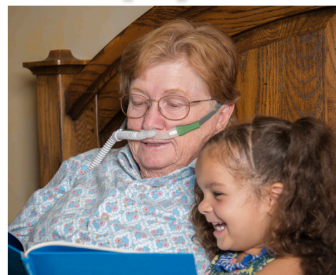
Oxygen generators and CPAP machines are widely-used devices. Please let Midwest Energy know if someone uses one in your home so we can flag your account with a health alert.

Call us at 1-800-222-3121 to learn more about Health Alert.